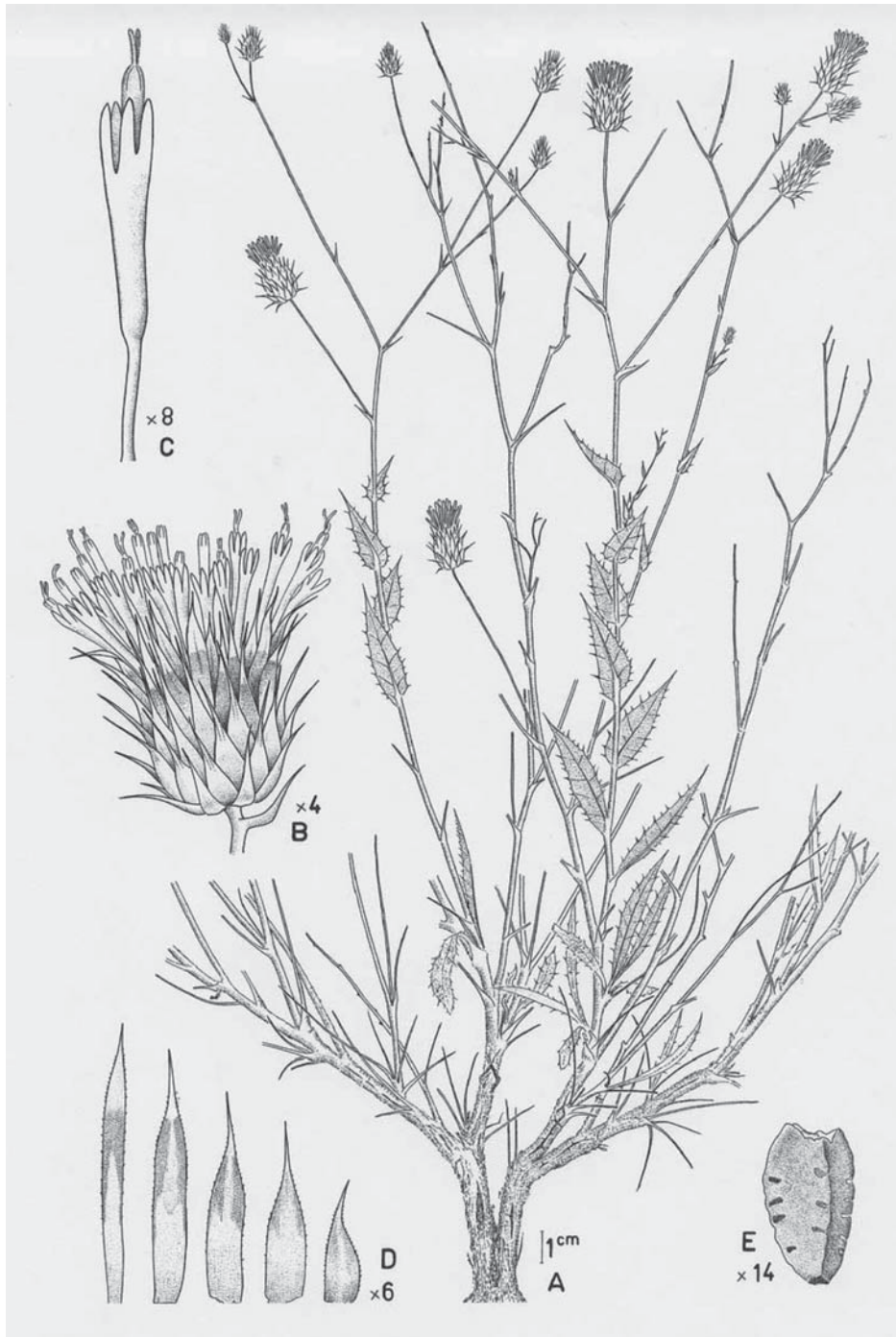
Fig. 1 Cousinia deserti var. longispinosa A — habit; B — capitulum; C — corolla; D — bracts; E — achene