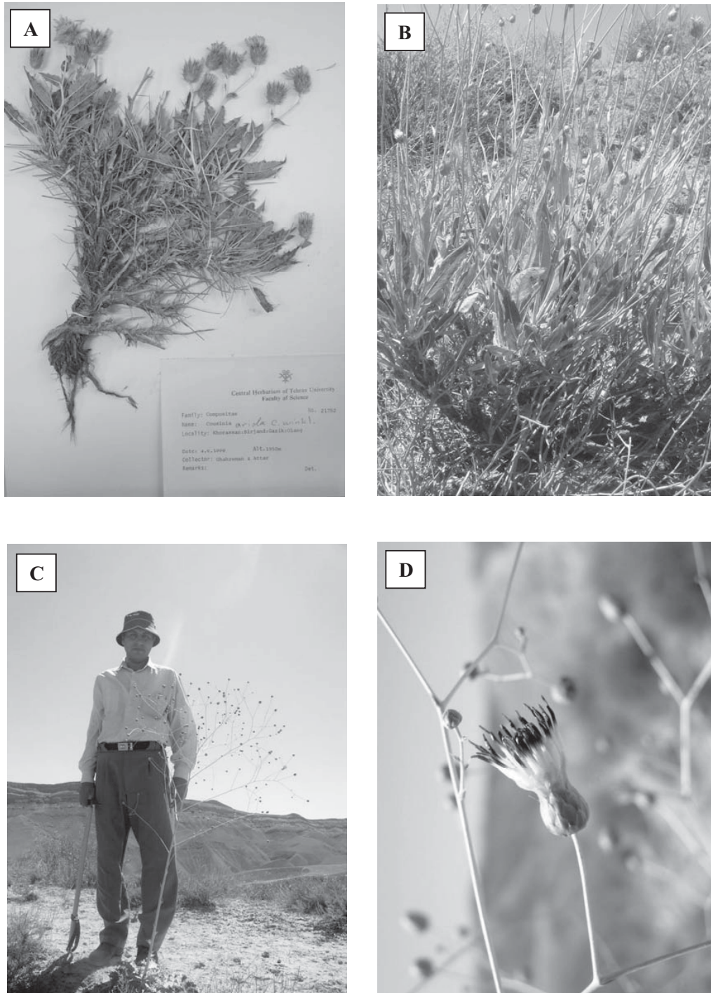
Fig. 3 A — C. arida ; B — C. turcomania ; C, D — C. linoczewskii